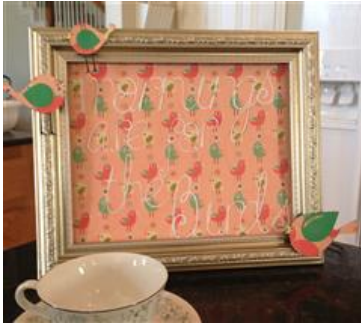
Mornings are for the Birds

Open Cricut Craft Room. Open Extreme Fonts. Drag and drop the letters "mornings are for the birds" on virtual craft mat (using standard 2.5 font size)