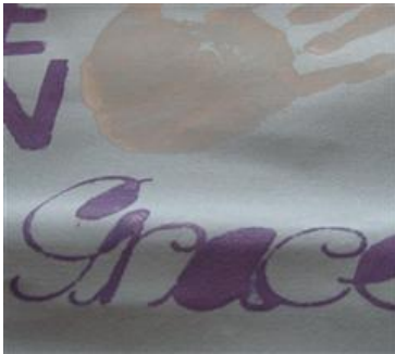
paint with stencil

Place the cutout and use the paint and foam brush to paint text onto your project piece.