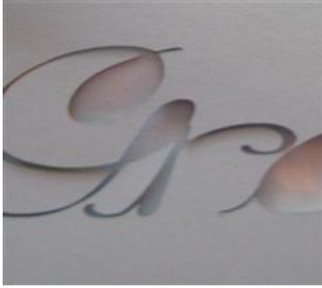
stencil cut out

Using CraftRoom to layout your text and cut.