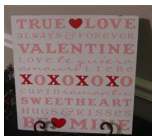
Word Collage Boards