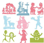
Nursery Rhymes Cartridge