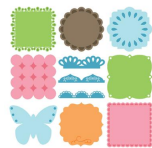
Elegant Edges Cartridge