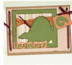
'6 Today' Card