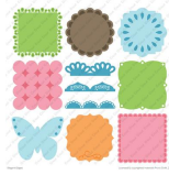
Cricut® Elegant Edges Cartridge