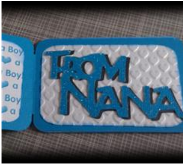
inside og card

This is the inside of card, I used the cuttlebug on the white metallic cardstock and used blue glitter card stock for from Nana and the shadow was black metallic card stock.