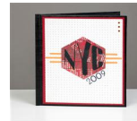
NYC 2009 Mini Album