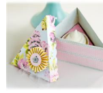
Sweet Cake Box