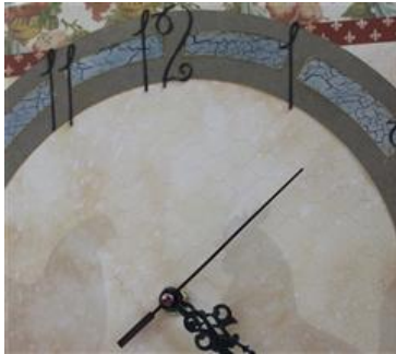
Clock Face From french Manor

The outer ring cut from the tan paper and the inner sections in the ring from the blue crackle paper are all that used for this project. Save the other cuts for a future project. Measure to find center and adhere clock face and the contrasting interior sections to canvas.