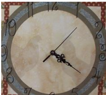
Homegrown Kitchen Clock

With a ruler measure to find the center of the clock face and mark it. Using a paper piercer make a hole on the mark. From the back of the canvas insert the clock mechanism making the hole bigger with a craft knife as needed. Snap on the clock hands to the front of the clock on the clock mechanism. Move all the clock hands to 12 o'clock and install the battery. Congrats!! Your beautiful personalized clock is now finished.