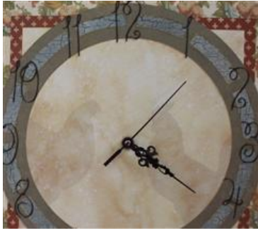
Extreme Font Numbers