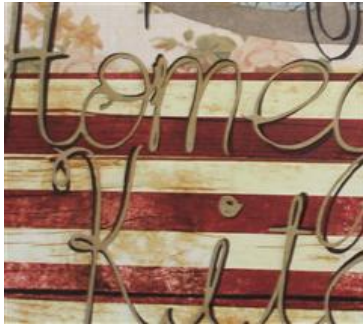
Phrase using Extreme Font

Using CCR and Extreme Font to make a phrase, this could be whatever you like. I chose to cut "Homegrown Kitchen". Letters cut at 2.5 for the tall letters and 1.278 for the short letters. I welded some portions of the phrase where it matched up and seemed reasonable. I cut the phrase two times, one in dark brown cardstock and the other in a tan cardstock. With a glue pen adhere the tan or lighter colored phrase offset on top of the darker phrase cut so that you see a shadow peeking out from behind the top layer. Glue down phrase using a glue pen. If preferred a sealer like mod podge or craft spray sealer can now be used on the clock to make it more resilient. Let sealer dry.