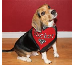
Valentine Doggie Bandana