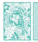
Cricut Cuttlebug™ 5" x 7" Embossing Folder & Border, Acanthus