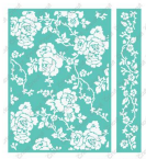
Cricut Cuttlebug™ 5" x 7" Embossing Folder & Border, Rosa