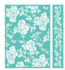
Cricut Cuttlebug™ 5' x 7' Embossing Folder & Border, Rosa