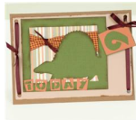
"6 Today' Card