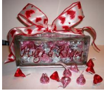
Hugs & Kisses Glass Block