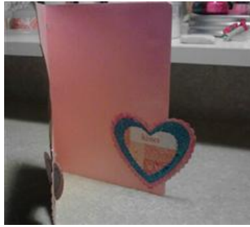
Inside heart is glued on and embelished with clitter