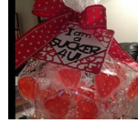
Valentines Sucker Gift Basket