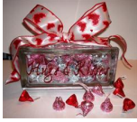
Hugs & Kisses Glass Block