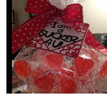
Valentines Sucker Gift Basket