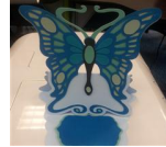
Butterfly Display card