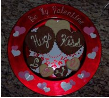
Plate of cookies

Assemble cookies (cookie sandwiches shown) then pipe frosting onto cookie using template.