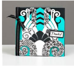
Thanks Designer Card