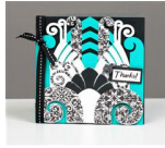
Thanks Designer Card