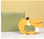
Thanks A Bunch Card