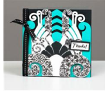
Thanks Designer Card