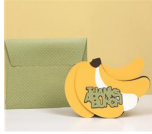
Thanks A Bunch Card