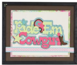
Ride 'Em Cowgirl Frame