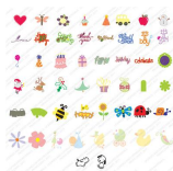
Cricut® Best Images of 2006 Cartridge