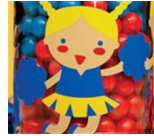
Gum Ball Jar