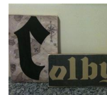
Pirate Name plaque