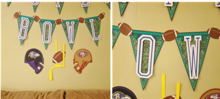
Decided on faux stitching

Decided on faux stitching with white gel pen.