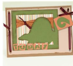
"6 Today" Card