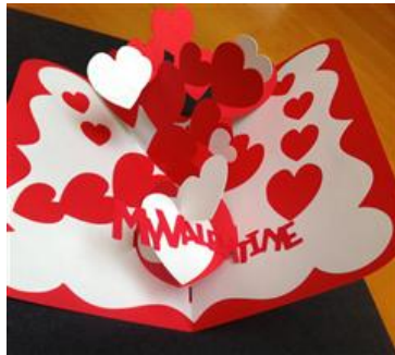
Red and White version