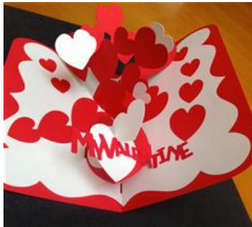
Red and White version