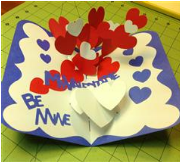
Finished card in 3 colors