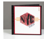
NYC 2009 Mini Album