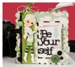
Be Yourself Mini Album