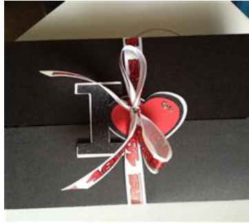
Card Wrapped Up