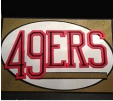
Inside of Card

To keep the card closed, cut a length of 49ers logo ribbon long enough (apprx 28") to tie around the card with a bow.