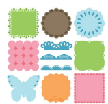
Elegant Edges Cartridge