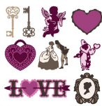
Victorian Romance Cartridge