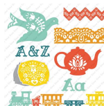
Folk Art Festival Cartridge