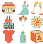
Wrap It Up Cartridge