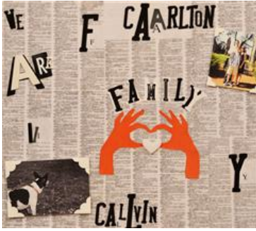
Family Canvas/Picture Frame Side 1

I used an 11x14 canvas as the base for this project for the second week of the Extreme Font Contest in the category Home. First, I used modge podge to adhere dictionary pages. The bigger dictionary letters spell "FAMILY." I then used Cricut's Extreme Big Font to cut the letters and added another layer of modge podge. I used the Valentine's Day 07 to cut the heart shaped hands in the middle. Finally, I added pre-cut corner edges and photographs.