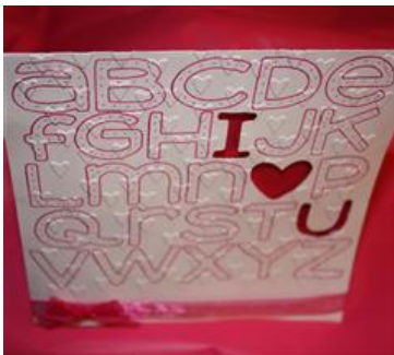
Slanted View of Card

Unload the mat. Using the Cuddlebug, run the top part of the card through the machine using the Cross Your Heart folder.