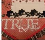
You are my True Love