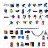
Batman The Brave and the Bold® Cricut® Cartridge