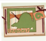
"6 Today" Card