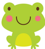
Create a Critter 01