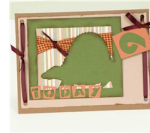
"6 Today" Card