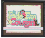
Ride 'Em Cowgirl Frame