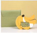
Thanks A Bunch Card