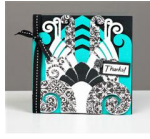
Thanks Designer Card