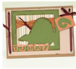
'6 Today' Card