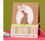
Chocolate Bunny Card