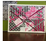
Easy DIY Bulletin Board.