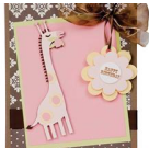
Happy Birthday Card - Giraffe