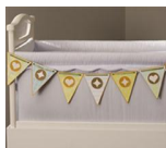
Welcome Crib Banner