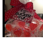
Valentines Sucker Gift Basket