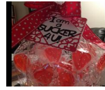
Valentines Sucker Gift Basket