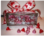
Hugs & Kisses Glass Block