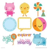
Create a Critter Cartridge