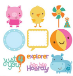
Create a Critter Cartridge