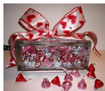
Hugs & Kisses Glass Block