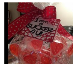
Valentines Sucker Gift Basket