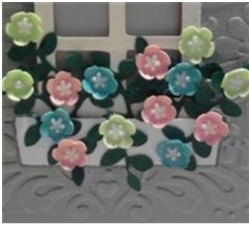
The flower box is cart " Forever Young image "Purse 1-s