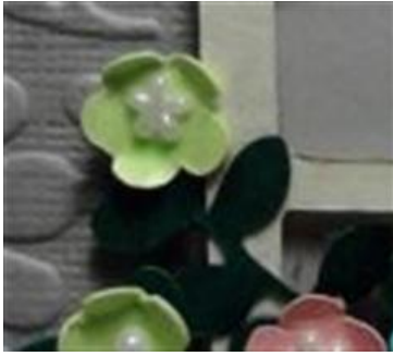
Cricut Essentials "Branch2-s"

Cricut Essentials: *Branch 2-s (cut 12 to 14) *Flower 4 (Cut 15, size under a half inch)