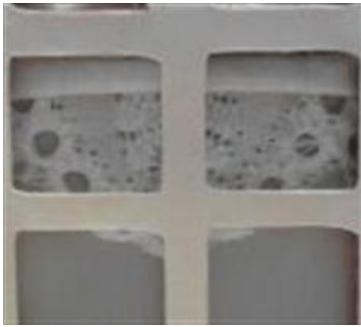
Pretty Penants (FlurDLIS)

Pretty Pennants: * FlurDLIS (cut 1 fpr inside of window) Note: I used a piece of lace