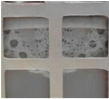
Pretty Pennants (FlurDLIS)