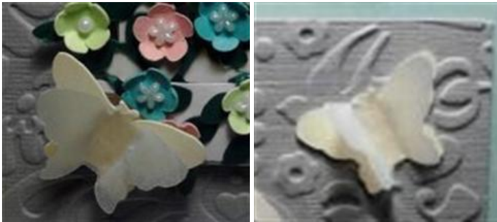
cardstock with tracing paper over lay

Note: the type of tracing paper I used was Strathmore 11 lb. The type or weight of paper may make a difference.