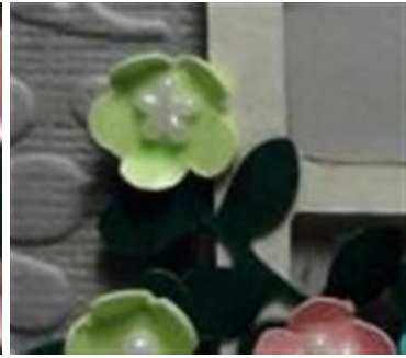
Cricut Essentials "Branch2-s"