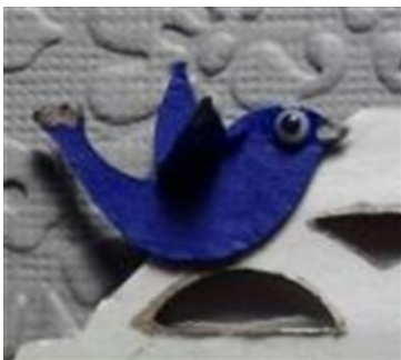
Alpy birds together leaving wings unglued the flod one wing down

Joys of the season/ Layers: * Doves (cut 1, then apply ontop of each other leaving wings unglued bend one wing down.)