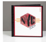
NYC 2009 Mini Album