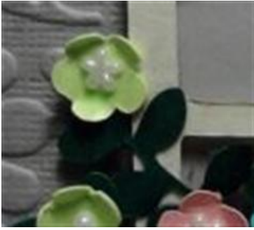
Cricut Essentials "Branch2-s"

*Flower 4 (Cut 15, size under a half inch)