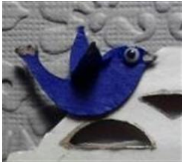
Alpy birds together leaving wings un- glued the fold one wing down

Nail Art applied in center of each flower, and bird's head for an eye. then a dot of permanent marker on the gem of the bird's eye to make contrast.