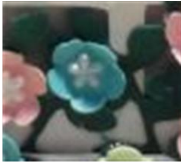
The center of flower is Nail art gems