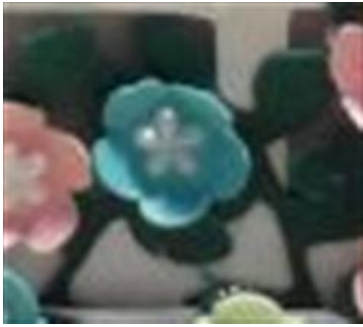
The center of flower is Nail art gems