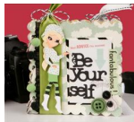
Be Yourself Mini Album