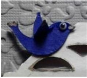
Alpy birds together leaving wings unglued the fold one wing down

Nail Art applied in center of each flower, and bird's head for an eye. then a dot of permanent marker on the gem of the bird's eye to make contrast.