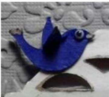
Apply birds together leaving wings unglued the fold one wing down

*Doves (cut 1, then apply on top of each other leaving wings unglued bend one wing down.)