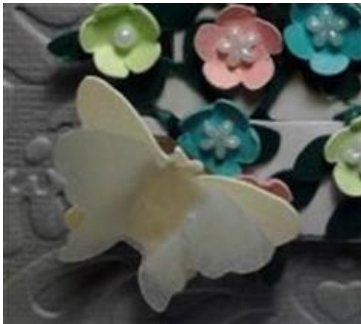
cardstock with tracing paper over lay

Cricut Craftroom Basics: * ButterFlies (cut 4, 2 out of card stock and 2 out of tracing paper) Note: the type of tracing paper I used was Strathmore 11 lb. The type or weight of paper may make a diffences.