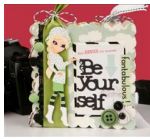
Be Yourself Mini Album