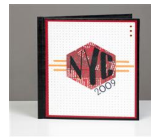
NYC 2009 Mini Album