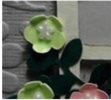
Cricut Essentials "Branch2-s"