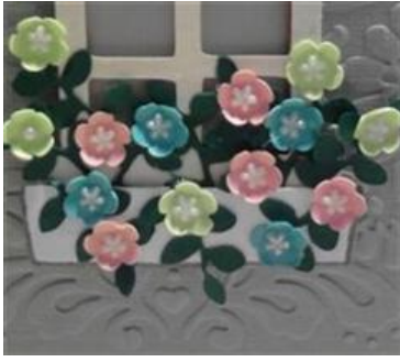
The flower box is cart " Forever Young image "Pirse 1-s