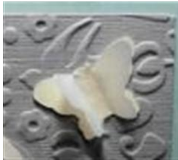
Apply only a little glue of cardstock butterfly then over lay tracing paper and watch the