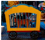
3D Tiger Circus Cage