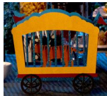
3D Tiger Circus Cage