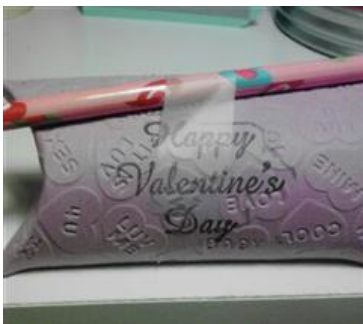
Tags, Bags, Boxes & More 2 Cart.

Rubber stamp message, then Glue sides together to shape a tub, let dry. Fill with candy and a surprise.