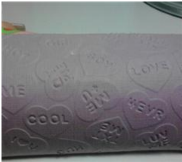
Embossed using "Love's in the Air" Cuttlebug folders

Cricut Cuttlebug Embossing folders: Love's in the Air, (candy hearts)