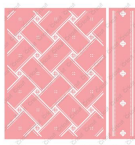
Cricut Cuddlebug™ A2 Embossing Folder & Border, Matelassé