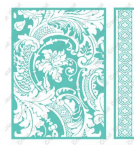
Cricut Cuddlebug™ 5" x 7" Embossing Folder & Border, Acanthus