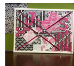
Easy DIY Bulletin Board.