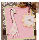
Happy Birthday Card - Giraffe