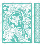
Cricut Cuttlebug™ 5" x 7" Embossing Folder & Border, Acanthus