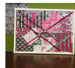
Easy DIY Bulletin Board.