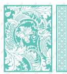
Cricut Cuttlebug™ 5" x 7" Embossing Folder & Border, Acanthus