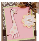
Happy Birthday Card - Giraffe